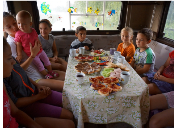
Our program helps to keep a group of over 80 children in school so that they have a real chance at a better future!

In most of Romania, if a child is not at grade level, there is no option for them but to drop out and take their chances without an education. This means service jobs at the lowest pay-scale which are not enough to live on.