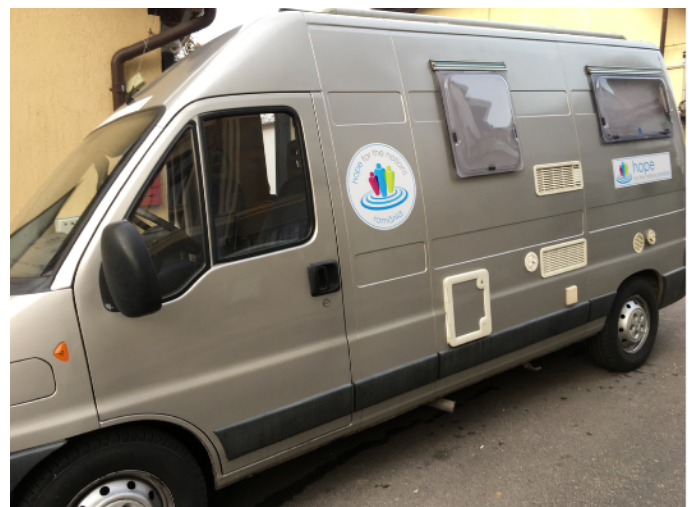
After many years, it was time to change out the old unit and thanks to a generous donation, we were able to purchase a new/used one. It makes for a great learning environment!