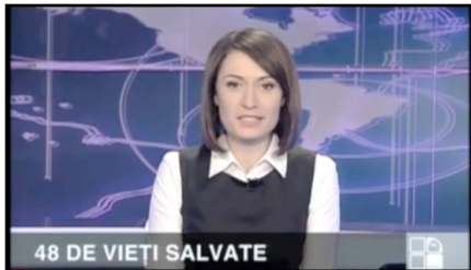
Moldovan Television coverage plays in Chisinau and also in Moscow, Russia