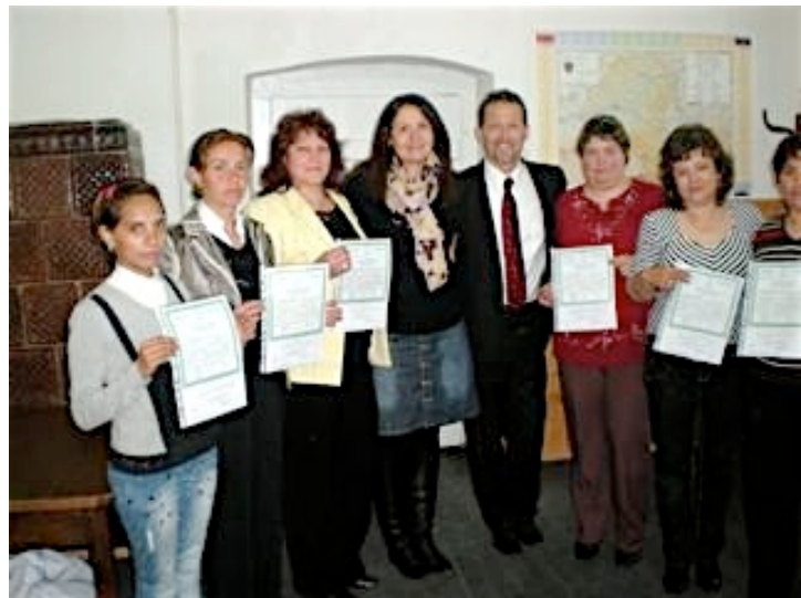
Some of the Graduates of the HFTN-RO 2011 Medical Mediator Diploma Course