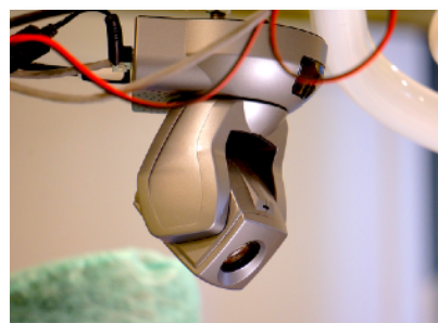
Surgery broadcast to the lecture hall via 2-way communication for live questions and responses

to create a small incision in the belly button, extract all the liquid from the cyst and then extract the tissue through the belly button. No scar, no infection, easy recovery. They saved this young woman's life. A great success!