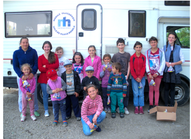
Our program helps to keep a group of over 80 children in school so that they have a real chance at a better future!

In most of Romania, if a child is not at grade level, there is no option for them but to drop out and take their chances without an education. This means service jobs at the lowest pay-scale which are not enough to live on.