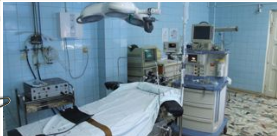
Operating room with new overhead video equipment purchased for workshop