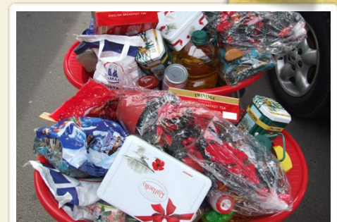
Hampers filled with Cheer