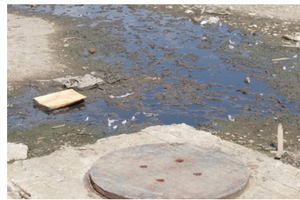
Farm 11 Water Project