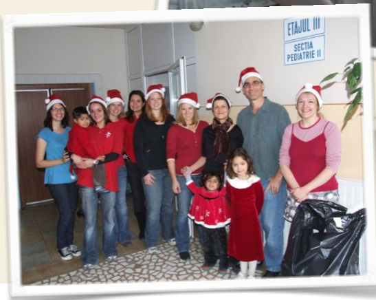
Long Term Volunteers

HFTN - Romania is privileged to contribute to the emotional well being of the babies in the Hospital's care.