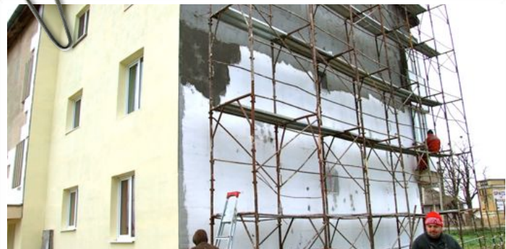
Farm 10 Renovations