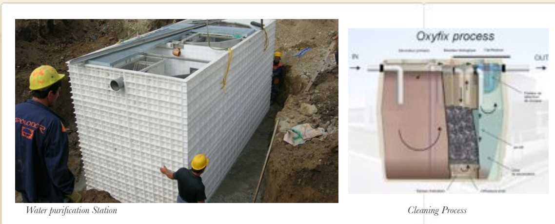
Water purification Station

This project will remove the current problem of children arriving at the hospital with bacterial infections. Everyone deserves clean water to live a healthier life!