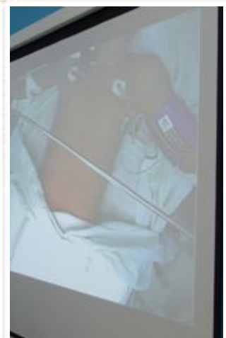
View from workshop room