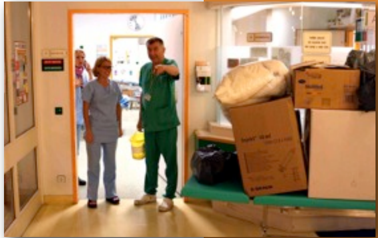
Using the Mobile Medical Unit to Transport Donated Medical Equipment from West to East