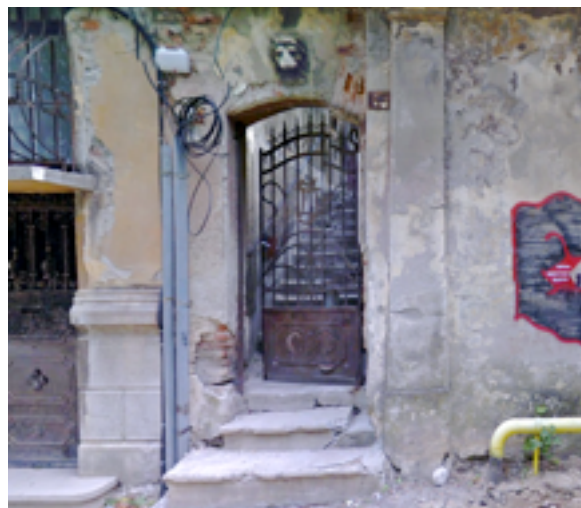
Condemned building where they have lived for the past decades