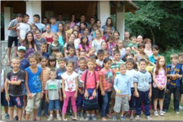
50 children from our projects attended our sixth Christian kids camp.