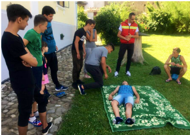
Trauma / Accident