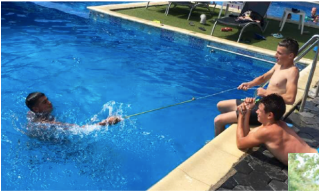
Pool and Water Rescue

Offering kids from all our projects a chance to experience Summer Camp