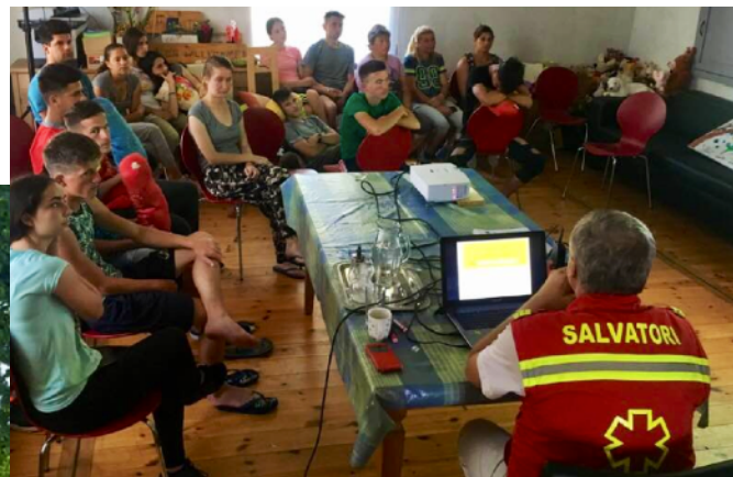
First Aid Theory / Exam Prep