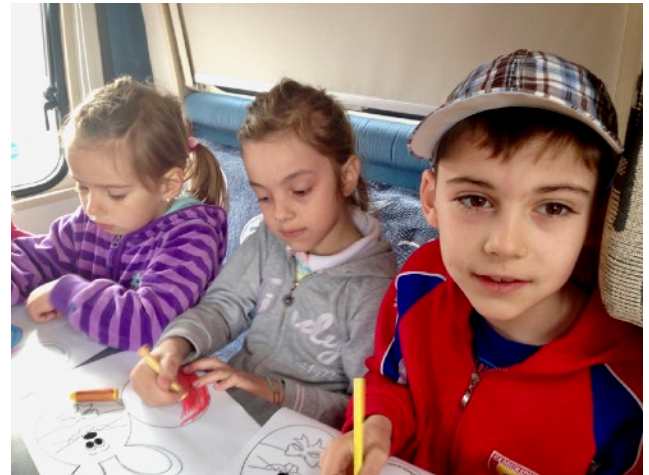
Our program helps to keep a group of over 80 children in school so that they have a real chance at a better future!

In most of Romania, if a child is not at grade level, there is no option for them but to drop out and take their chances without an education. This means working jobs at the lowest pay-scale which are not enough to live on.