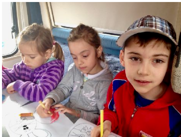
Our program helps to keep a group of over 80 children in school so that they have a real chance at a better future!

In most of Romania, if a child is not at grade level, there is no option for them but to drop out and take their chances without an education. This means working jobs at the lowest pay-scale which are not enough to live on.